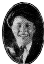
BE HIS PAL