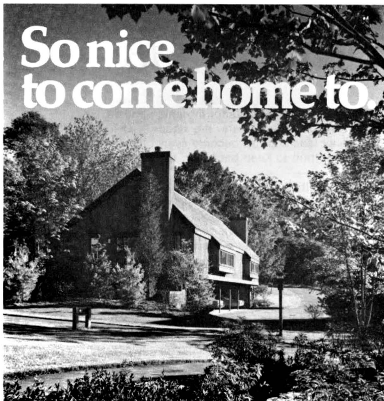
On site photo of cluster homes.